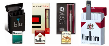
Tobacco companies own most popular vaping products

You can see the shocking similarities between the tobacco and vape industries' marketing tactics by just looking at their advertising campaigns.