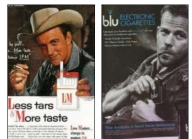
Similar advertising strategies