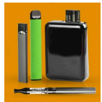
Common vaping devices